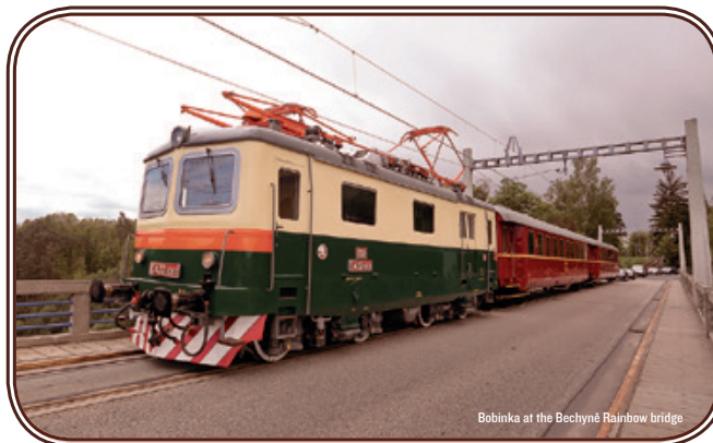
Bobinka at the Bechyně Rainbow bridge