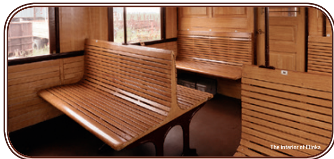
The interior of Elinka

The organisers reserve the right to modify the schedule.