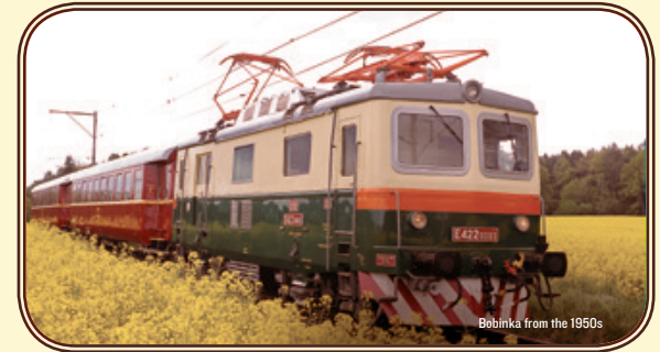
Bobinka from the 1950s