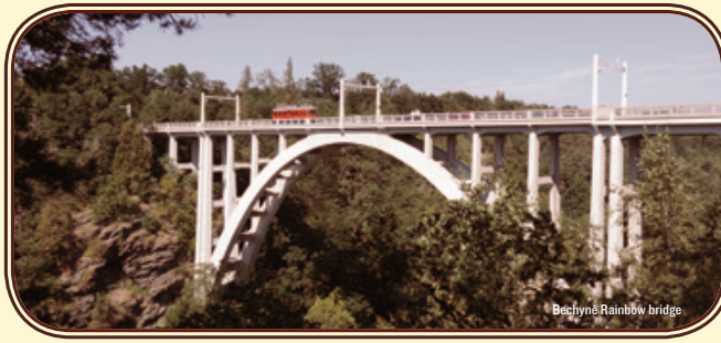
Bechyňe Rainbow bridge

Elinka – global fares, compulsory reservation Bobinka runs on @ and + from 16 June to 16 Sept